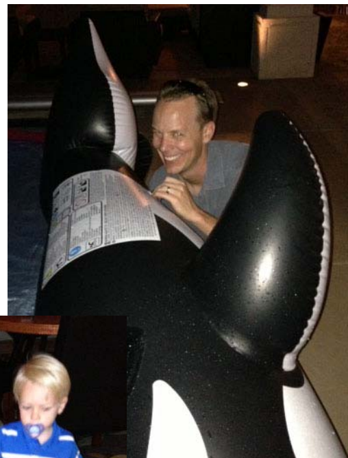
“Lion” taming and Orca wrestling were events of the evening.