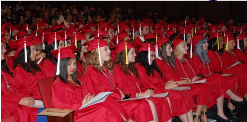
Degree Candidates —167 candidates walked across the stage in Popejoy Hall!