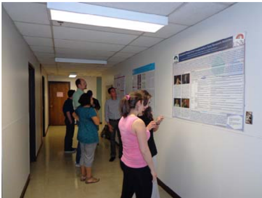
Undergraduate students presenting their posters.

Title: “Conceptual and Practical Considerations for the Dissemination and Practice of Empirically Supported Treatments”